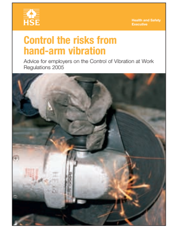
This is a web-friendly version of leaflet INDG175(rev2), reprinted 01/08

Advice for employers on the Control of Vibration at Work Regulations 2005